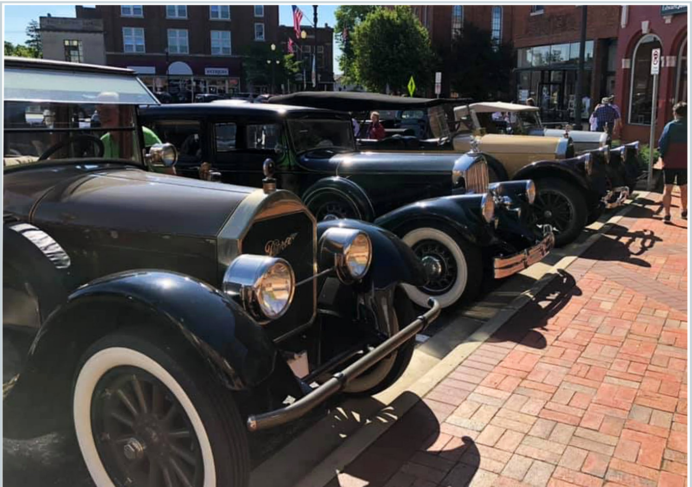
Some of the Pierce-Arrows at the 2019 National Meet.

Spirit of St. Louis Region Classic Car Club of America