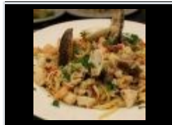
Bartolino's Osteria – Fine Italian Dining

Bartolino's Osteria – Fine Italian Dining in St. Louis