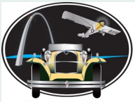
Spirit of St. Louis Region Classic Car Club of America