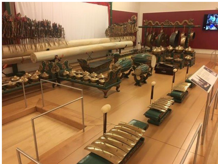
Ancient musical instrument museum at Scottsdale.