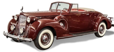
SOLD 1938 Packard Twelve 1607 Convertible Coupe