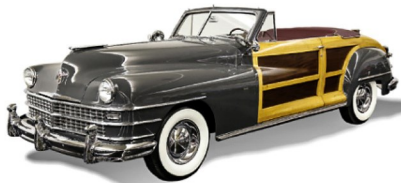
1948 Chrysler Town & Country Convertible