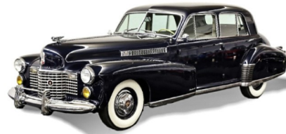
1941 Cadillac Fleetwood 60 Special Imperial Sedan

St. Louis Car Museum and Sales can do the Job! We take the stress and worries out of selling your Antique, Classic, & Special Interest Autos!