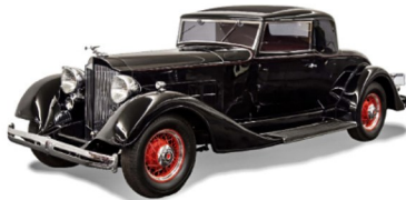
1934 Packard Eight 1101 Rumble Seat Coupe