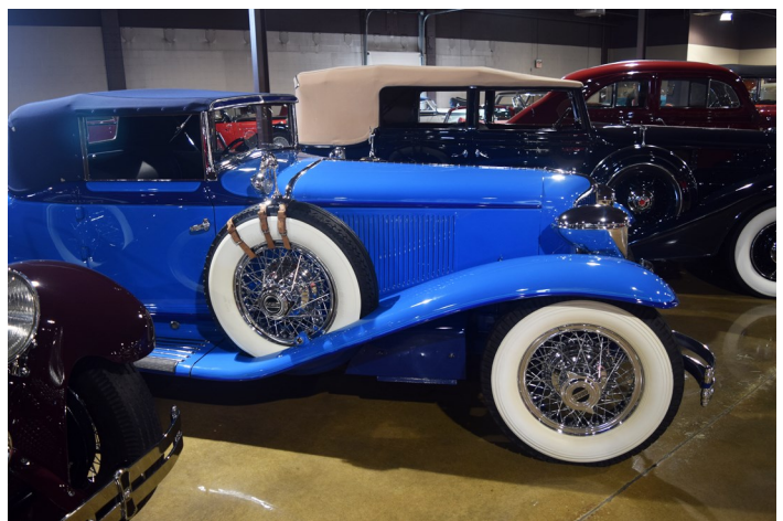
This beautiful blue 1930 Cord L-29 is one of the great cars available at Hyman's, Ltd.