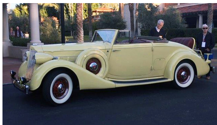
Left: 1928 Stutz at Worldwide Auctioneers Auction. Above: 1936 Packard at the CCCA Car Show.