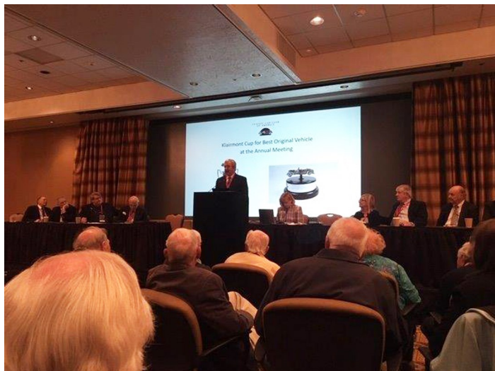
CCCA National Membership Meeting.