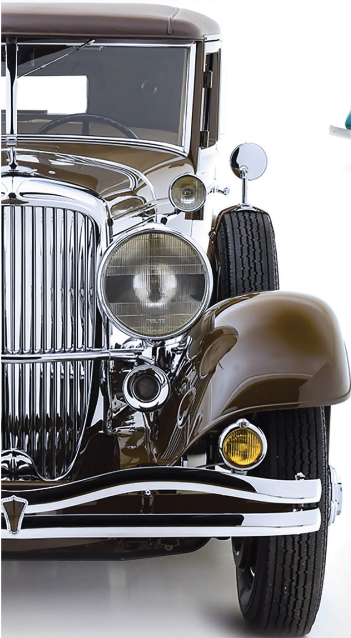
SOLD 1935 DUESENBERG MODEL J JUDKINS SPECIAL BERLINE