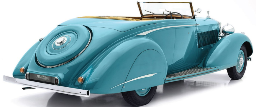
SOLD 1937 ROLLS-ROYCE PHANTOM II