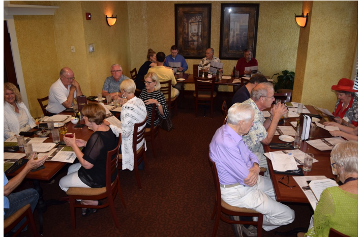
Twenty two Spirit of St. Louis Region members enjoyed a great dinner and Fellowship at the July 2019 Spirit Night meeting at Bartolino's Osteria in South St. Louis County.